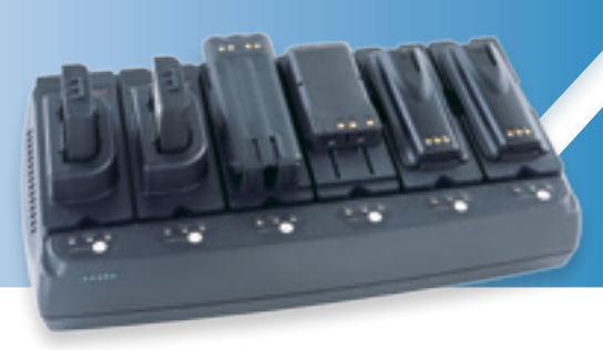
Universal Conditioning Charger